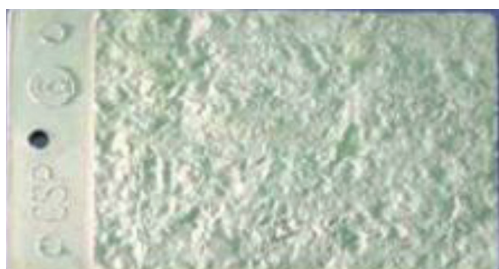
ICRI CSP 6